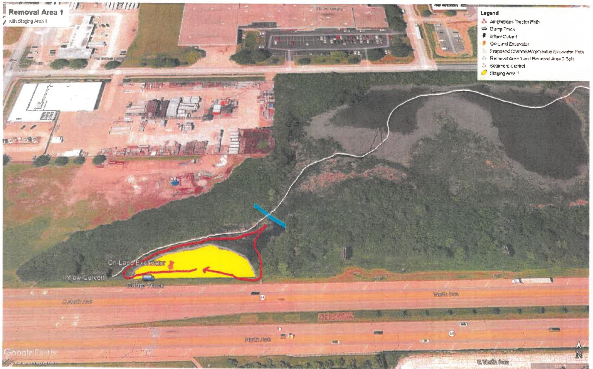
Figure 14. Area 1 Mechanical removal operational overview.