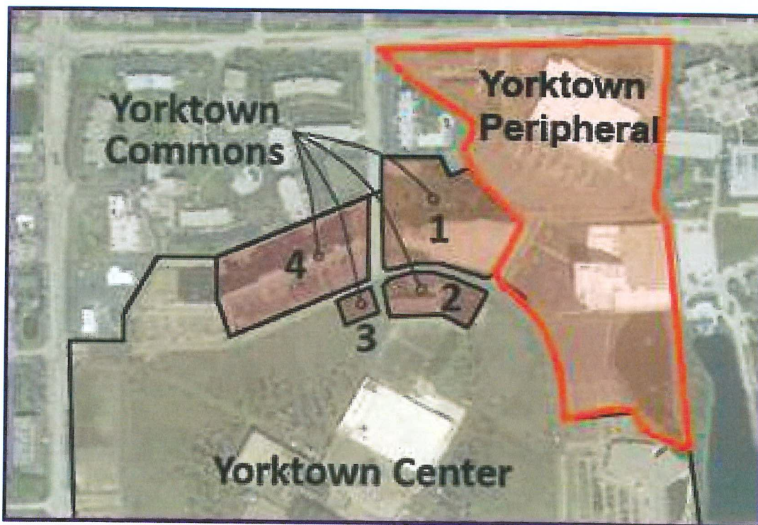
Yorktown Commons and surrounding planned developments

The further redevelopment of Yorktown Center began in 2015, when Yorktown ownership turned its attention to the redevelopment of the northern portion of the center. This area previously consisted of the long-closed Bamboo Room, the underperforming Yorktown Convenience Center and a vacant lot, all oriented around the intersection of Grace Street and the Yorktown Ring Road. Throughout 2015, Yorktown Center ownership worked with the Village to develop a vision for this area, which became known as Yorktown Commons. Since then, Yorktown Commons Parcels 1 and 2 have been developed with multi-family apartment complexes (Elan (#1) and Overture (#2)), which were constructed in the 2017-2019 period and are essentially at full occupancy.