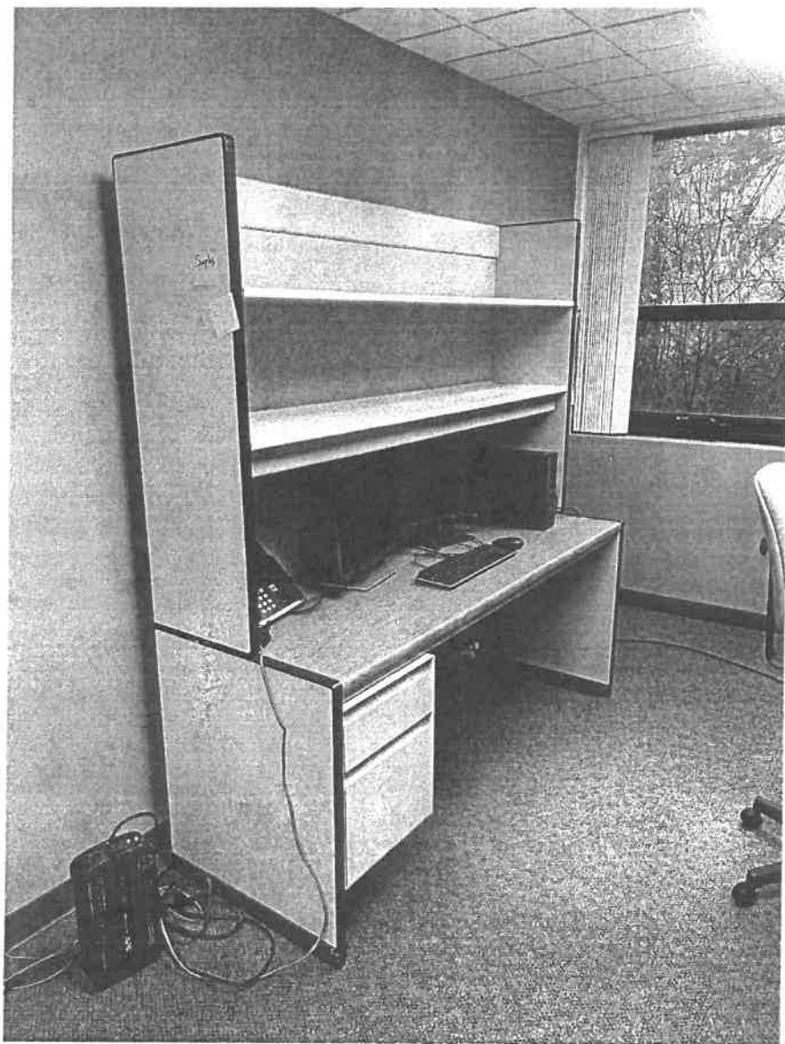
Wood laminate table