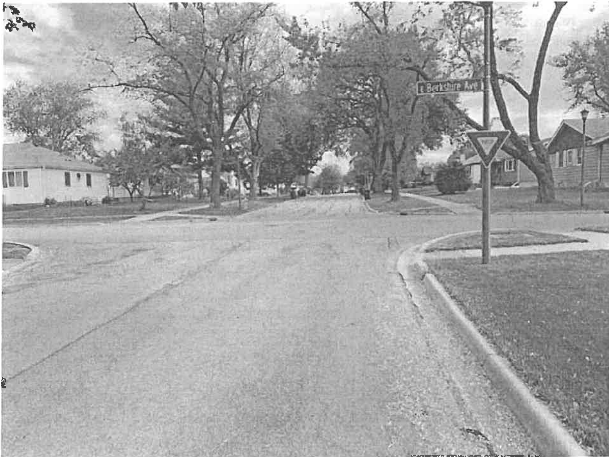
N/B Lombard at Berkshire

The Police Department recommends that the yield signs be replaced by stop signs because of the restricted view. This information will be presented at the next PTSC meeting.