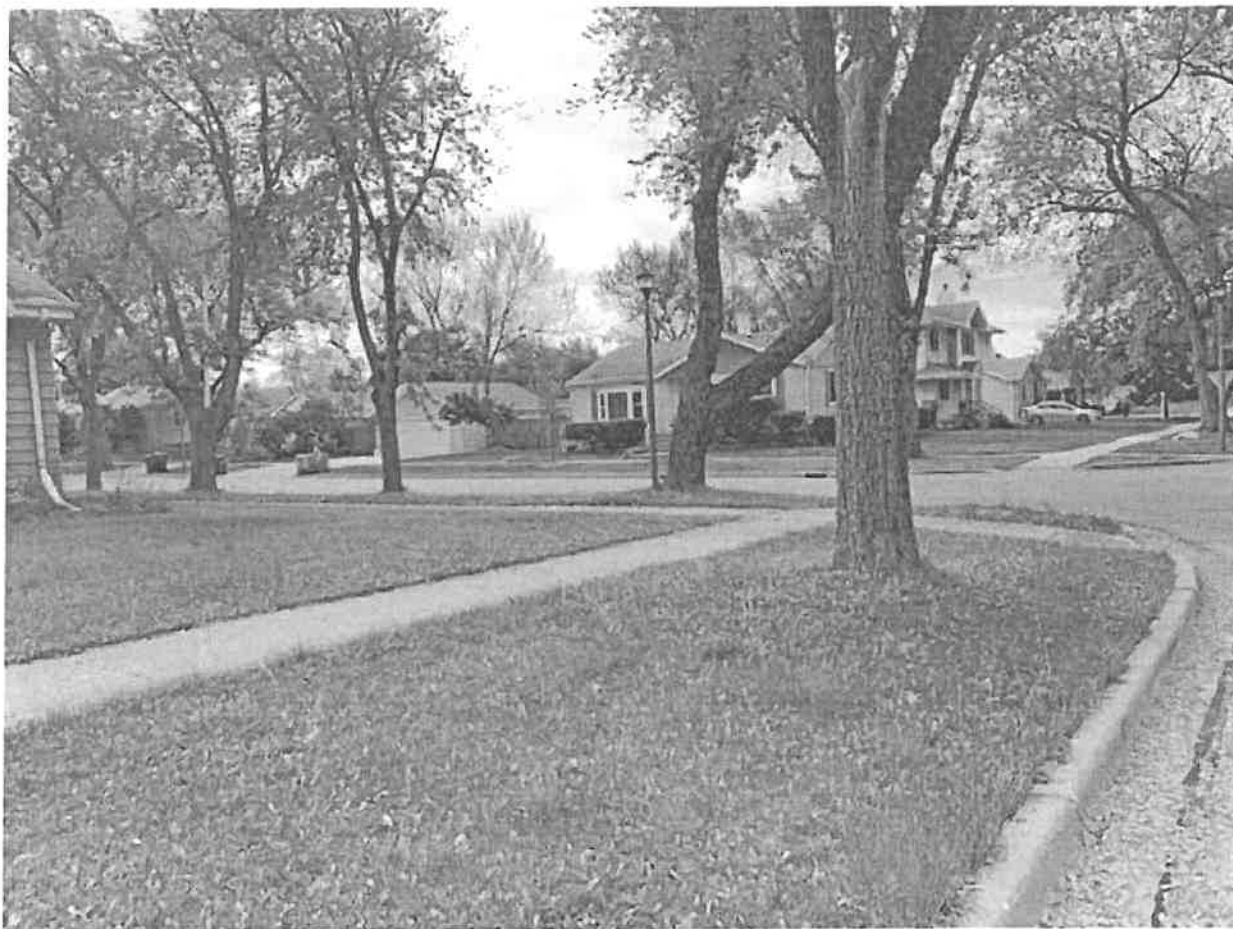
S.B Berkshire at Lombard