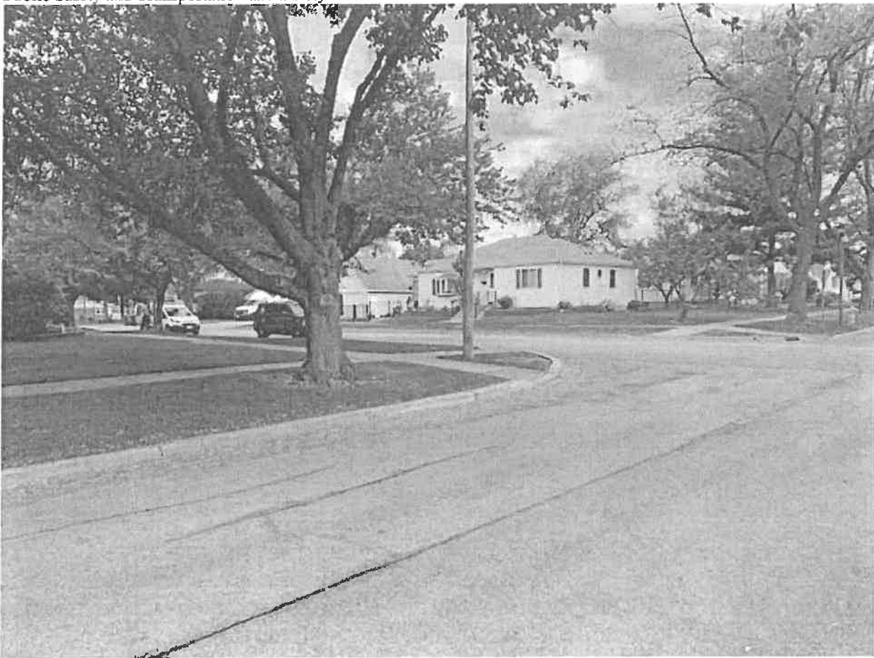
N/B Berkshire at Lombard