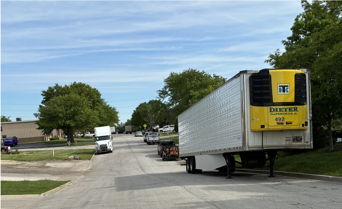
Photo #1 – Looking north adjacent to 951 Ridge Ave, Semi-trailer stored in an allowed parking location and a semi parked in a no parking area location