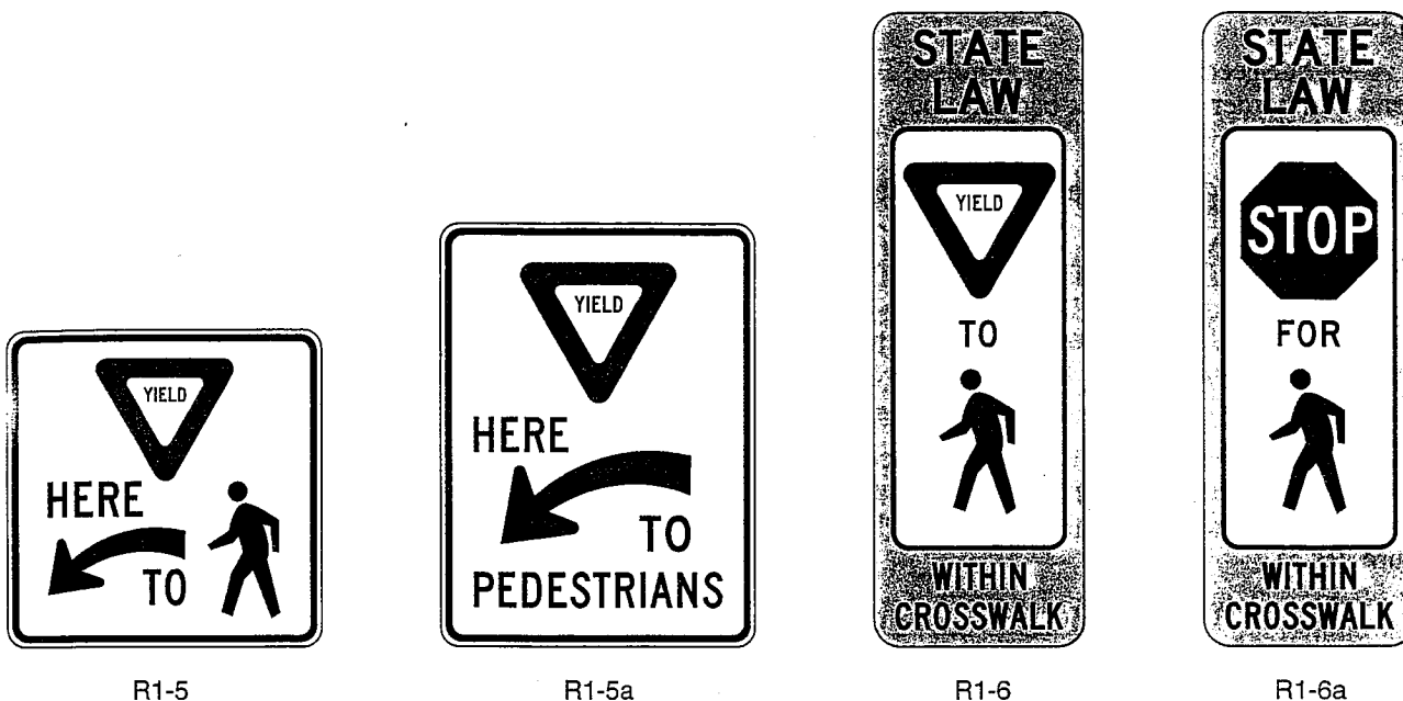
Figure 2B-2. Unsignalized Pedestrian Crosswalk Signs